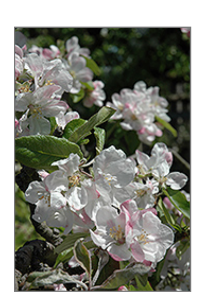
Wealthy Apple flowers

This is a deciduous tree with a more or less rounded form. Its average texture blends into the landscape, but can be balanced by one or two finer or coarser trees or shrubs for an effective composition. This is a high maintenance plant that will require regular care and upkeep, and is best pruned in late winter once the threat of extreme cold has passed. Gardeners should be aware of the following characteristic(s) that may warrant special consideration;