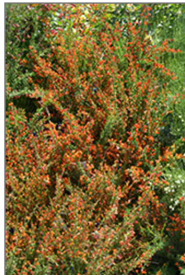
Lena Scotch Broom in bloom

This shrub should only be grown in full sunlight. It prefers dry to average moisture levels with very well-drained soil, and will often die in standing water. It is considered to be drought-tolerant, and thus makes an ideal choice for xeriscaping or the moisture-conserving landscape. It is particular about its soil conditions, with a strong preference for clay, alkaline soils, and is able to handle environmental salt. It is highly tolerant of urban pollution and will even thrive in inner city environments. This particular variety is an interspecific hybrid.