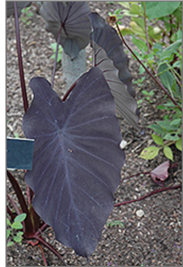
Black Magic Elephant Ear foliage