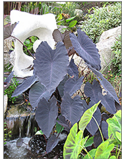
Black Magic Elephant Ear