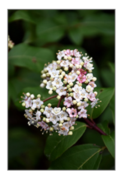
Compact Laurustinus flowers

Compact Laurustinus is recommended for the following landscape applications;