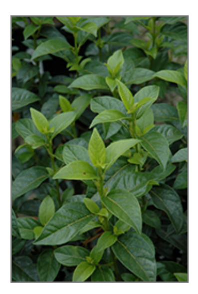
Compact Laurustinus foliage