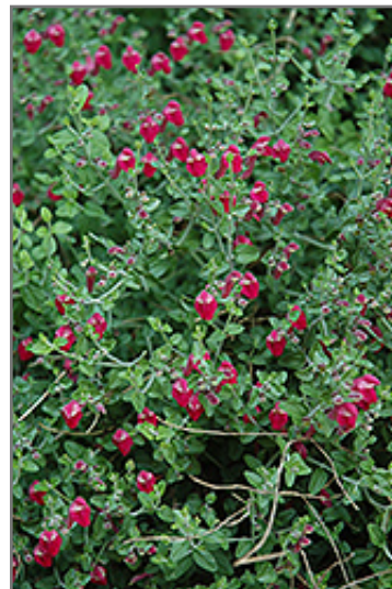
Texas Rose Pink Skullcap flowers

Texas Rose Pink Skullcap is recommended for the following landscape applications;