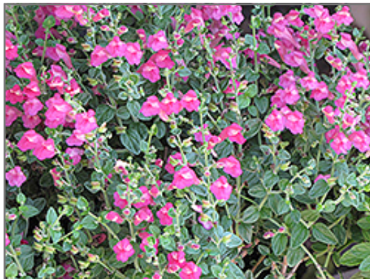
Texas Rose Pink Skullcap in bloom

Texas Rose Pink Skullcap will grow to be only 4 inches tall at maturity extending to 6 inches tall with the flowers, with a spread of 15 inches. When grown in masses or used as a bedding plant, individual plants should be spaced approximately 12 inches apart. Its foliage tends to remain low and dense right to the ground. It grows at a fast rate, and under ideal conditions can be expected to live for approximately 4 years. As an herbaceous perennial, this plant will usually die back to the crown each winter, and will regrow from the base each spring. Be careful not to disturb the crown in late winter when it may not be readily seen!