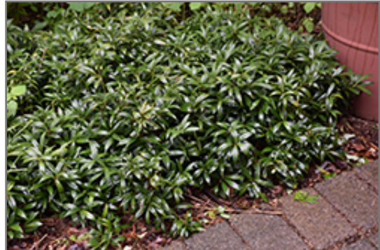
Himalayan Sweet Box

Himalayan Sweet Box is recommended for the following landscape applications;